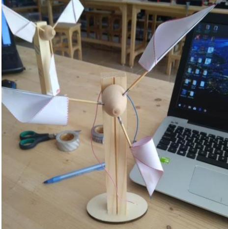
Figure 2. Designed windmill