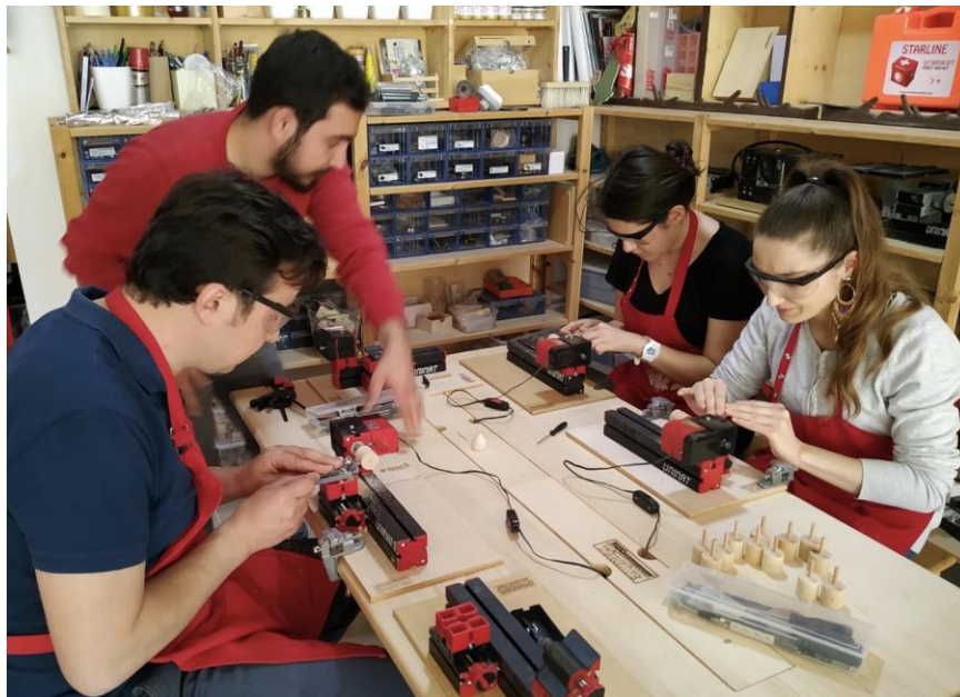
Figure 1. Editing semi-structured wooden model pieces